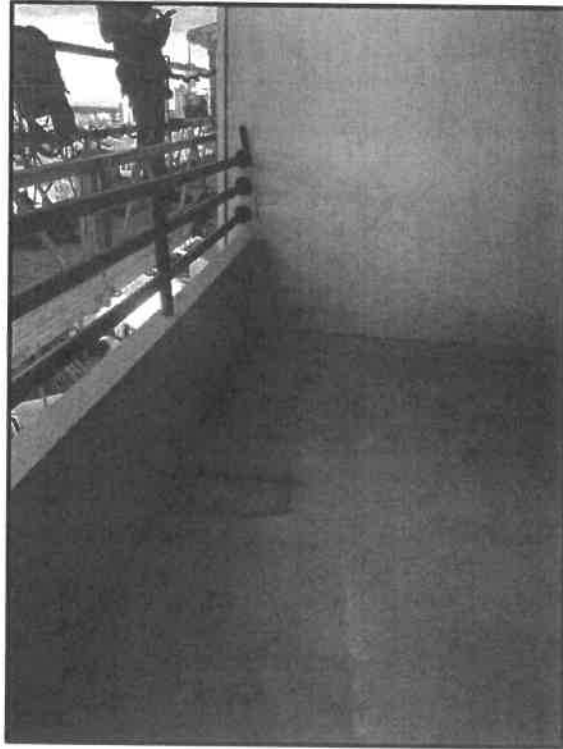
Photograph #3: Damage identified at the balcony of Unit 6A1