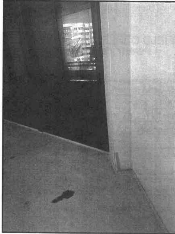
Photograph #1: Damage identified at the balcony of Unit 17A1