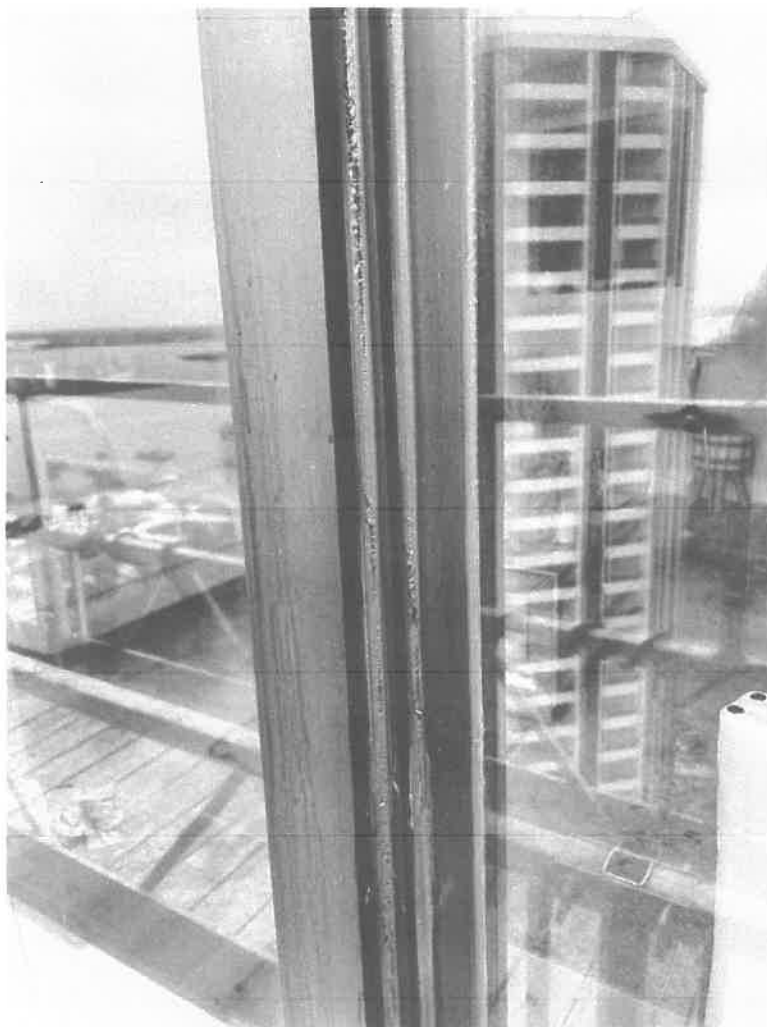
Photograph #1: Degraded sealants observed at the 05 window wall of Tower A