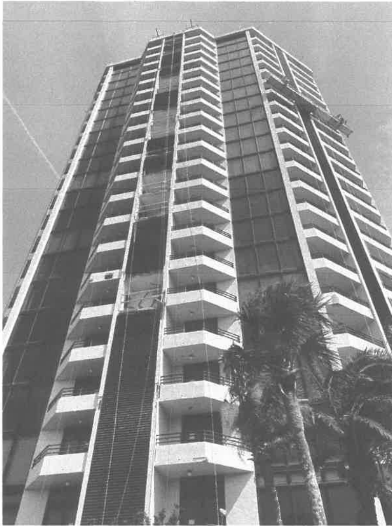
Photograph #1: Restoration work in-progress at the 05/06, 06/01 and 01/02 balcony stacks