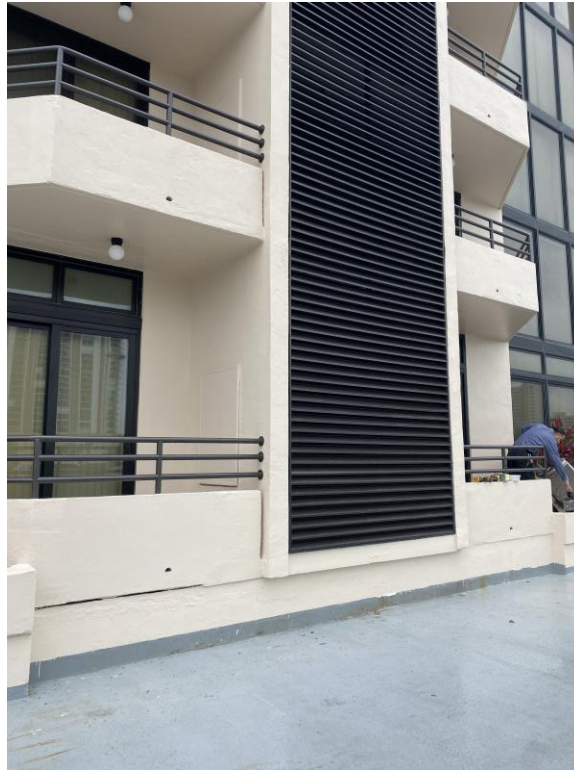
Photograph #1: Completed balcony restoration at the 03 and 04 stack at Tower A