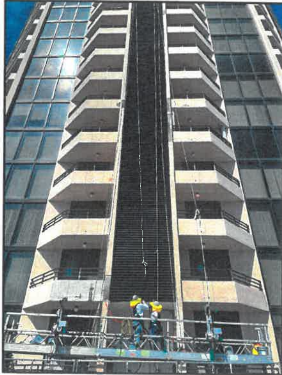
Photograph #1: A/C louver re-installation in-progress