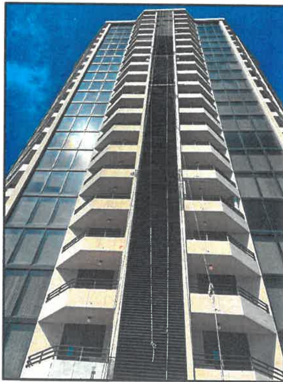
Photograph #2: A/C louver re-installation in-progress