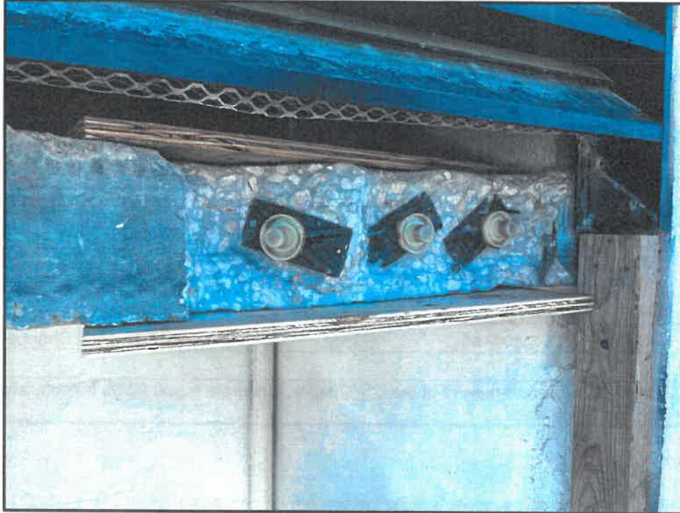
Photograph #1: Accepted concrete repair at the 14 th floor slab edge