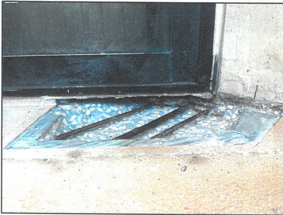
Photograph #3: Topside repair at the balcony of Unit 1A1 requested to be further excavated