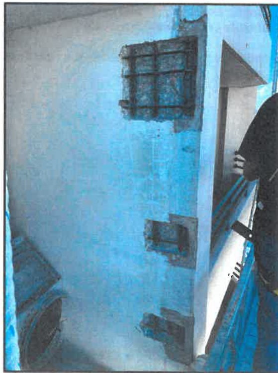
Photograph #2: Accepted wall repairs located at the interior of the A/C closet at the 5 th floor