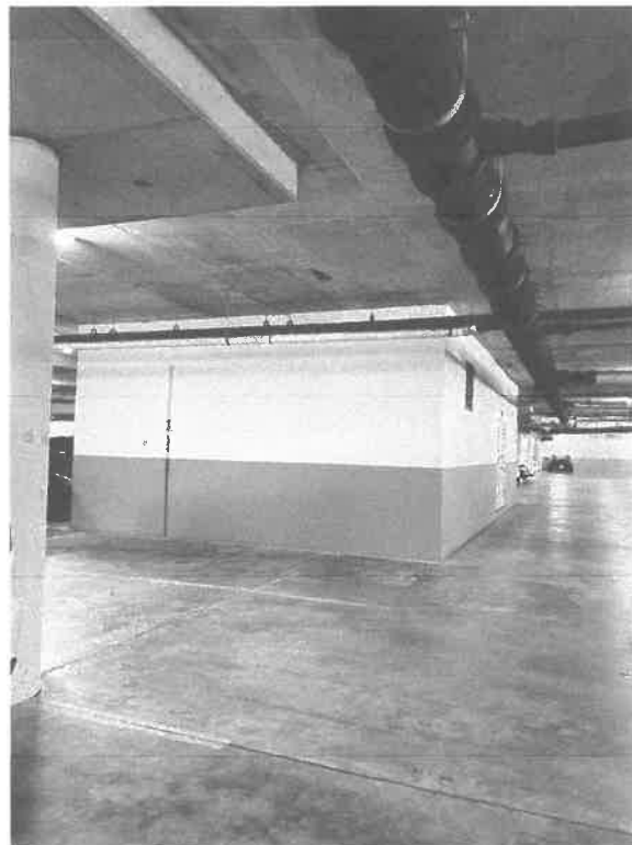
Photograph #4: Post tension work in-progress on the garage ceilings