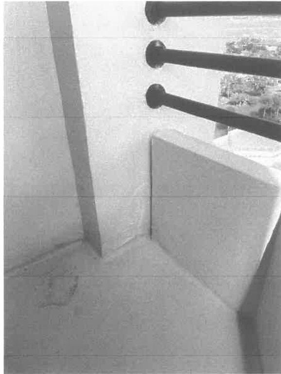
Photograph #1: Damage identified at the 04 balcony stack