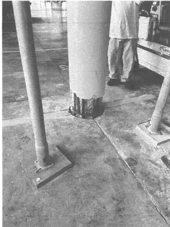
Photograph #3: Column repair requiring further excavations